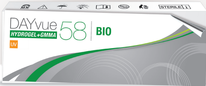
box of 30 daily contact lenses