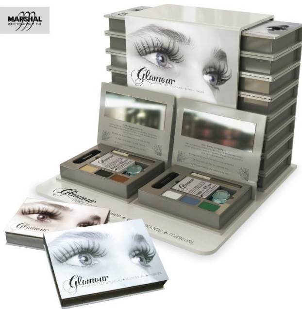
set of 2 monthly quadricolor contact lenses + make up