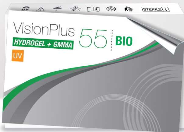
box of 6 monthly contact lenses